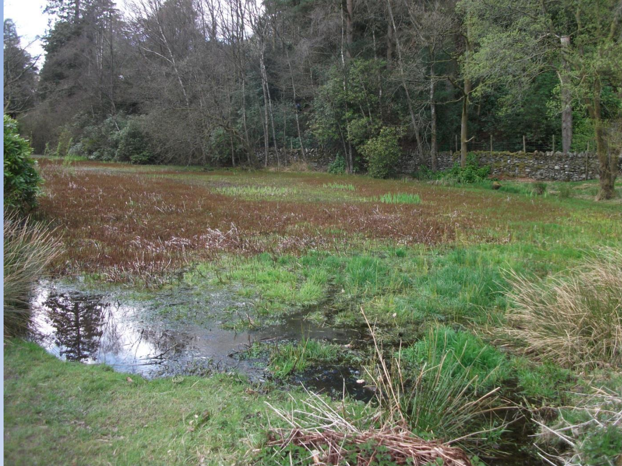
Skater's Tarn – Infestation of Pigmy Weed?